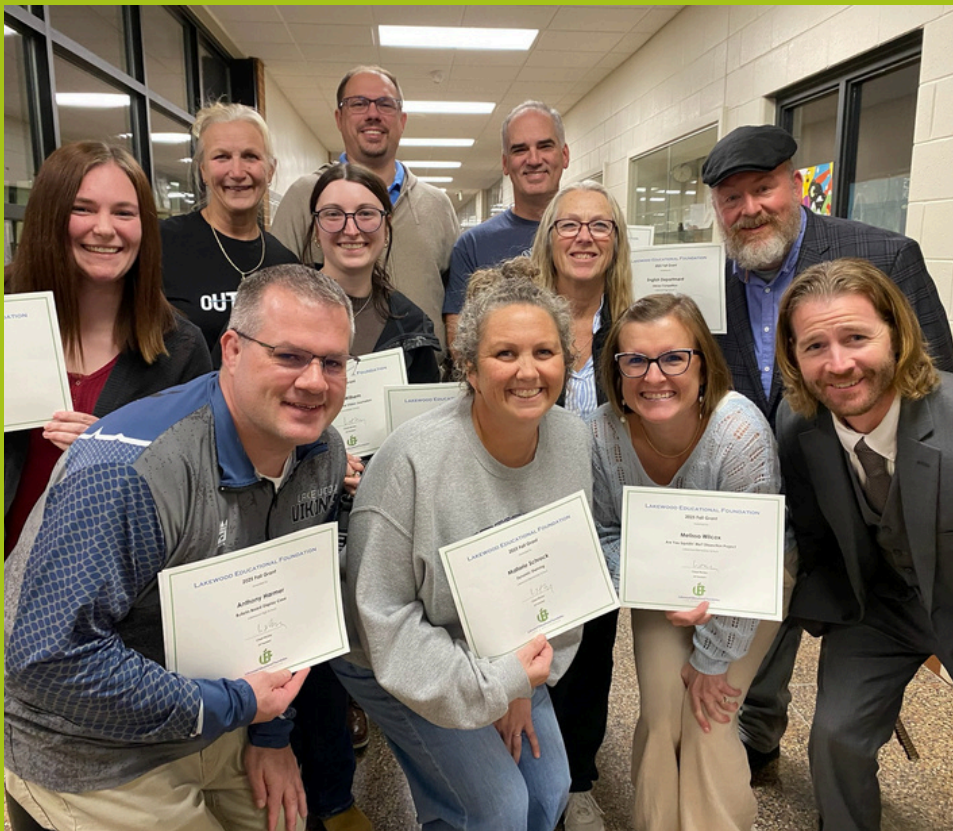
2025 Fall Grant Awardees

Note: updated to reflect Abby M. grant, awarded post decision meeting.